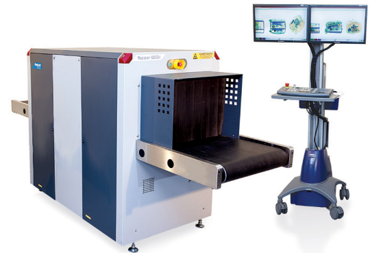
Shown with optional Operator Pedestal

The Rapiscan 620DV is an advanced checkpoint screening solution, designed for aviation and high security applications. It uses innovative dual view technology to generate a horizontal and vertical view of the object under inspection.