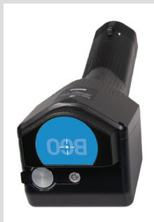
The Guardian 501 BGO A fast, efficient radionuclide identifying device

The Guardian™ 501 family of handheld Radionuclide Identifying Devices (RID) excels at detecting gamma, beta, neutron, and cosmic radiation emitted by both natural and man-made sources. With exceptional precision, it can identify special nuclear material as well as industrial, medical, and naturally occurring radioactive sources.