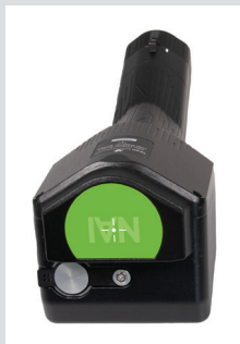
The Guardian 501 NAI A fast, efficient radionuclide identifying device

The Guardian™ 501 family of handheld Radionuclide Identifying Devices (RID) excels at detecting gamma, beta, neutron, and cosmic radiation emitted by both natural and man-made sources. With exceptional precision, it can identify special nuclear material as well as industrial, medical, and naturally occurring radioactive sources.